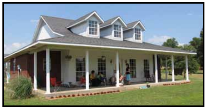
The Lenamond's beautiful house