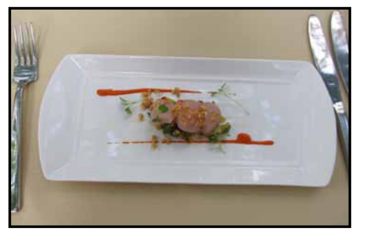
Orange Blossom Honey