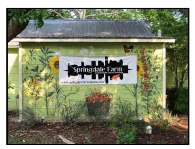
Texas Honey Supper held at Springdale Farm in Austin

Clover Honey (Goodflow) with honey cake, goat's milk ricotta, sesame, pistachio.